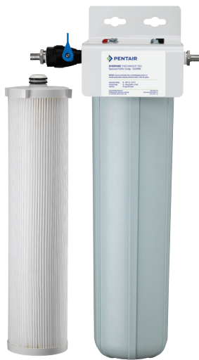
Endurance TKO MicroFilter Pretreatment System: EV9437-50

HIGH CAPACITY PRETREATMENT SYSTEM FOR FOODSERVICE APPLICATIONS